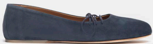
M24 OPERA SLIM NAVY