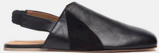
M06 SANDAL SQUARED BLACK