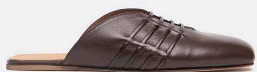
M04 SLIPPER IN NAPPA BROWN