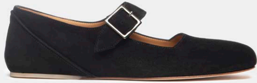
M05 MJ SQUARED BLACK