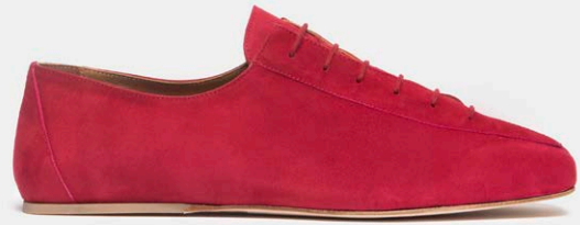
M03 DRESSED RED