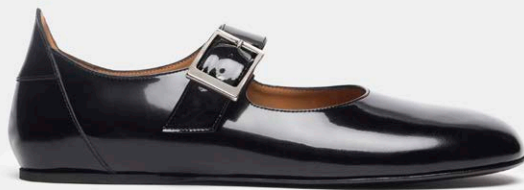
M13 MJ CURVY TOTAL BLACK