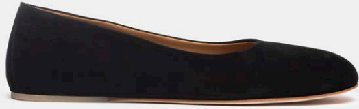
M11 MINIMAL CURVY BLACK