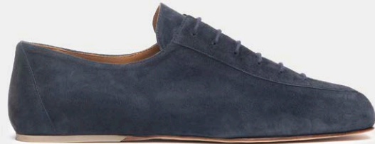
M03 DRESSED NAVY