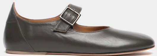
M13 MJ CURVY GREEN