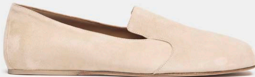
M01 BASIC OFF WHITE