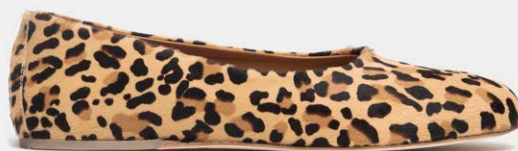
M21 MINIMAL SLIM ANIMALIER