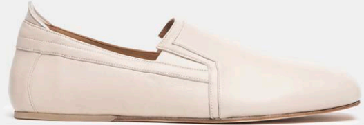
M02 SLIP ON OFF WHITE