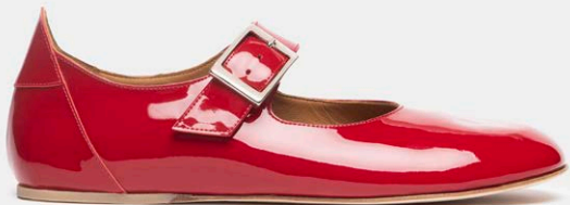
M13 MJ CURVY RED