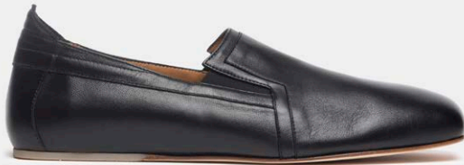
M02 SLIP ON BLACK