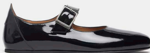
M23 MJ SLIM BLACK