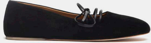
M12 OPERA CURVY BLACK