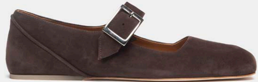
M05 MJ SQUARED BROWN