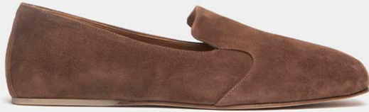
M01 BASIC BROWN