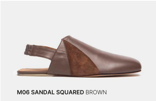
M06 SANDAL SQUARED BROWN