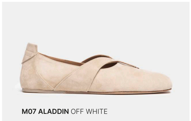
M07 ALADDIN OFF WHITE