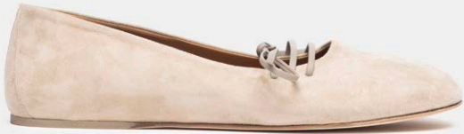
M12 OPERA CURVY OFF WHITE