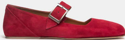
M05 MJ SQUARED RED