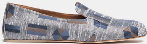
M01 BASIC NAVY