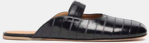
M15 SLIPPER W BLACK EEEL