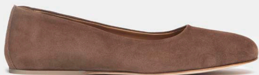
M21 MINIMAL SLIM BROWN