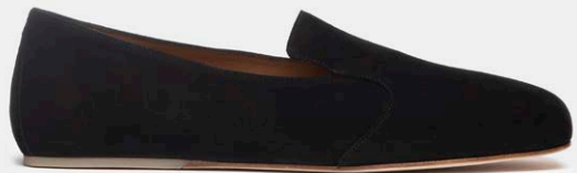
M01 BASIC BLACK