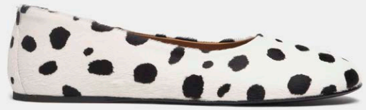
M11 MINIMAL CURVY BLACK AND WHITE