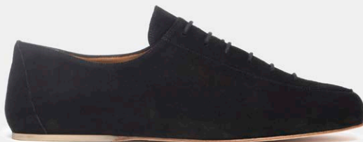
M03 DRESSED BLACK