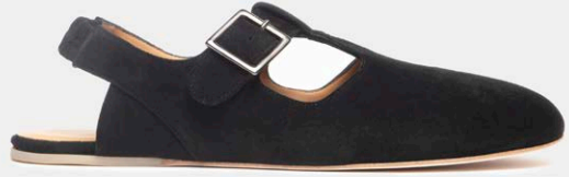
M14 BIG EYES CURVY BLACK