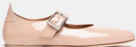
M23 MJ SLIM GLOSSY NUDE