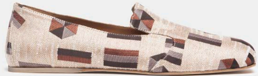
M01 BASIC D.BROWN