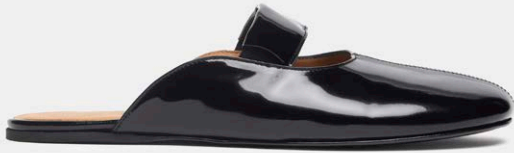
M15 SLIPPER W PATENT BLACK