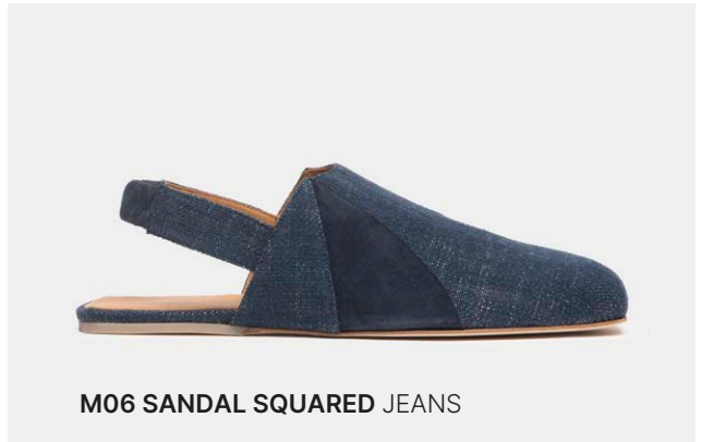
M06 SANDAL SQUARED JEANS