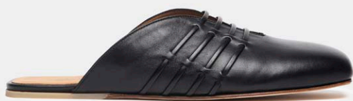
M04 SLIPPER IN NAPPA BLACK