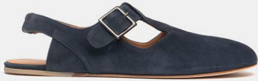
M14 BIG EYES CURVY NAVY